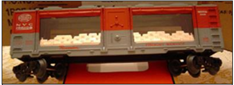
Beautiful NYC color scheme and the first ever produced copper load.

Regardless, to have this car available in a timely manner (no year or year-and-a-half wait time here), this was a reasonable decision. At the end of 2007, our one and only ad was submitted to the National Headquarters News (NHN), our order was placed with Lionel, the car was announced in the Waybill to METCA members (Dec. 2007), and the ad appeared in the NHN for all TCA members to see (Jan. 2008).