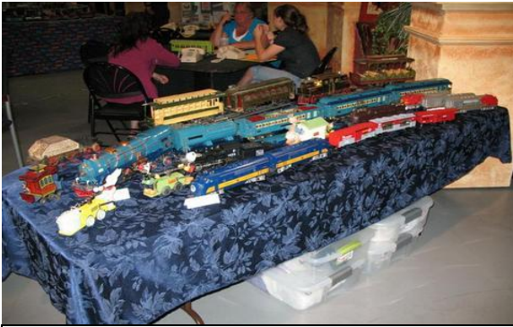
LOTS of old trains! See the prototype of the new METCA