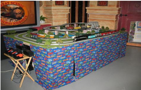
The layout as featured on WNJN-TV

“Sure,” I said, “we can do that for you”, knowing full well I had to build one~ Fast! The display layout we brought was 6’x 9’. Two perimeter loops and a figure 8 with a 45-degree crossing made up the lower level; we squeezed in an upper level to have plenty of action for the cameras. Some Plasticville buildings, Life-Like trees, a cardboard ‘lake’ and ‘Main Street’ filled out the rest.