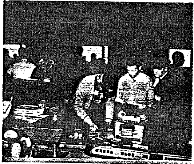
PHOTOS FROM THE FEB. 19th MEET. Despite inclement weather during the week prior to the meet, things turned out as predicted - The best attended meet to date. Present were 276 members and 48 guests.